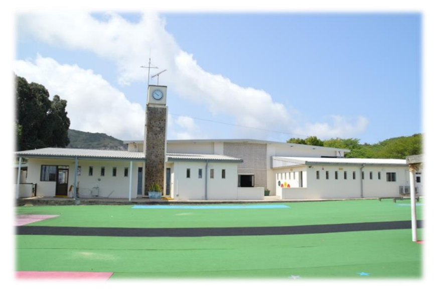
Two Boats School

Ascension hosts one school, Two Boats School. At Two Boats School, provision is made for the educational needs of all children aged 3-16 on Ascension Island. The school is housed in a purpose-built building, situated in Two Boats village. The majority of pupils live in Two Boats village or Georgetown, 6km away, and the pupils from Georgetown are transported to and from school by school buses.